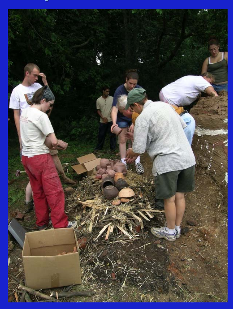
Laying the base of the glass furnace