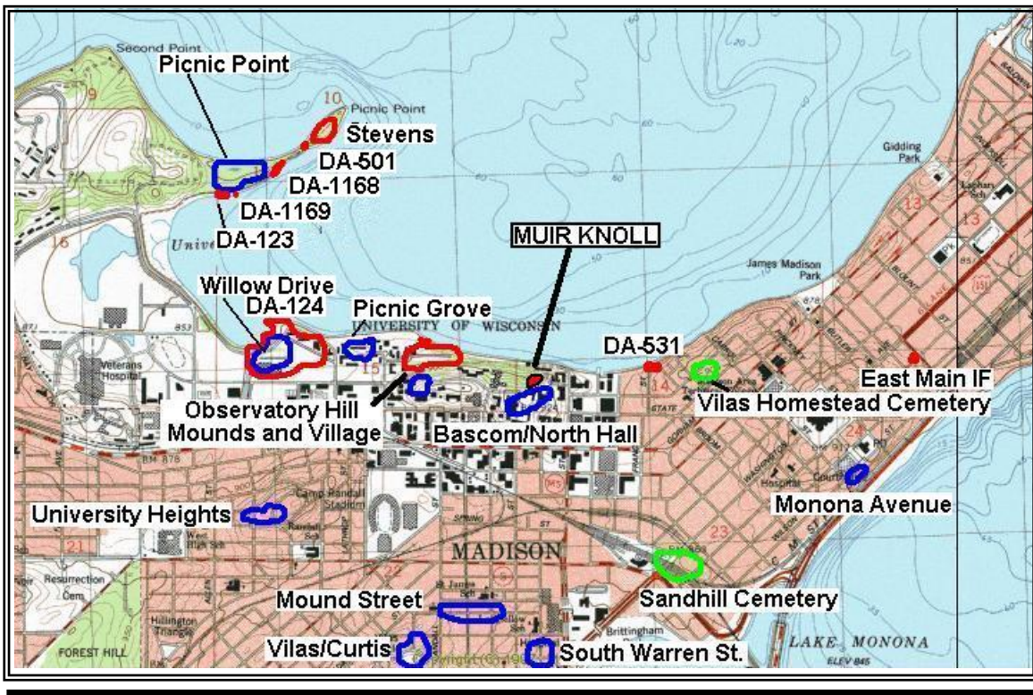
Figure Two: Previously reported archaeological sites within one mile of the proposed project area. Blue denotes pre-contact burial mound groups, red denotes pre-contact habitation areas and green denotes post-contact cemeteries.

during the pre-contact period, and saw intensive occupation during the mature Late Woodland stage (AD 750-1100).